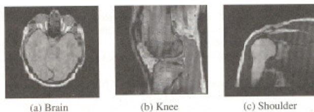
Fig. 2 Images used in the experiments.

In Table 1, the degradation and distortion in the watermarked images are presented. In Fig. 3 one of the images after some attacks such as brightness, contrast, compression and rotation is shown. The percentage of recovered watermark after these attacks is shown in Table 2. From the results it can be seen our proposed scheme is robust to several attacks while allowing to recover the watermark message.